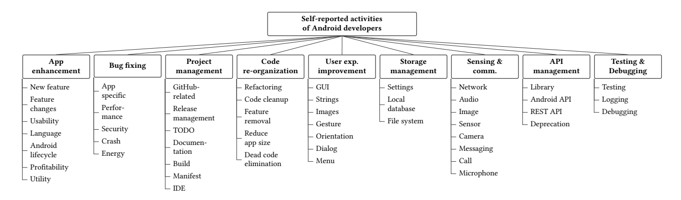
Figure 2: Taxonomy of self-reported activities of Android developers